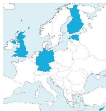
Figure 1. MultiCO-project’s blue and white logo and the map of Europe presented on the cover page.